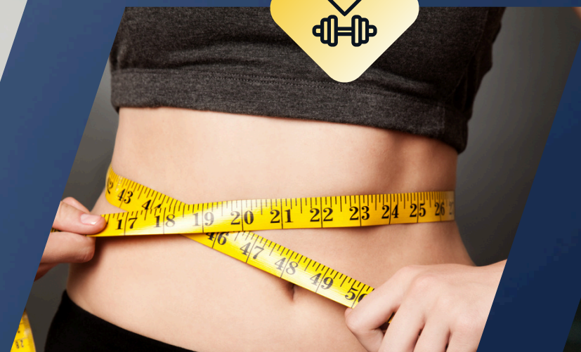
Pérdida de peso