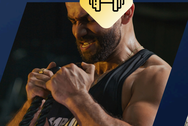
Regeneración y recuperación muscular